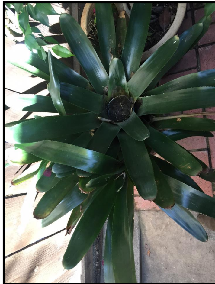
Neo green apple - shady