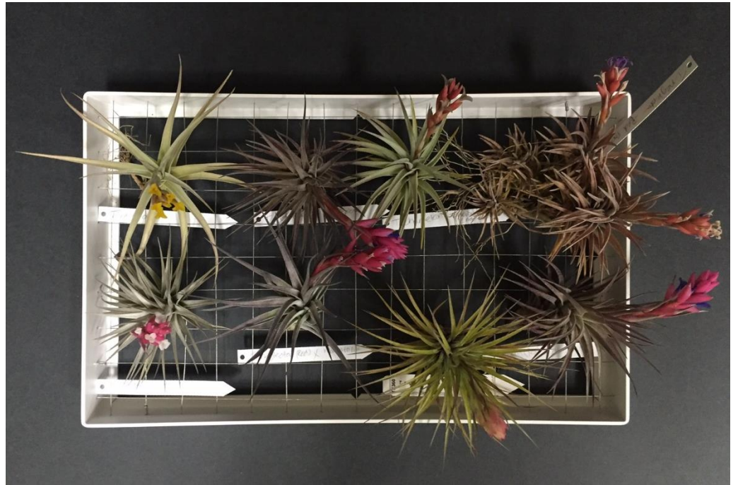
Tillandsia hybrids - Pam Koide-Hyatt