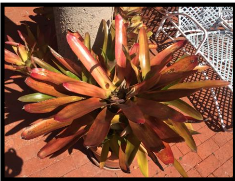
Neo green apple - part-sun

I have certainly killed my share of bromeliads, but I find that experimenting with one that you have several of is a good idea. I have a neo called Green Apple that is very prolific so I have cut off pups and grown them in many different ways. In full sun they stay small and turn yellow with light red striations, in shade they are deep and a beautiful dark green, in partial sun they are medium size and the leaves turn bronze red. You would never know it is the same plant.