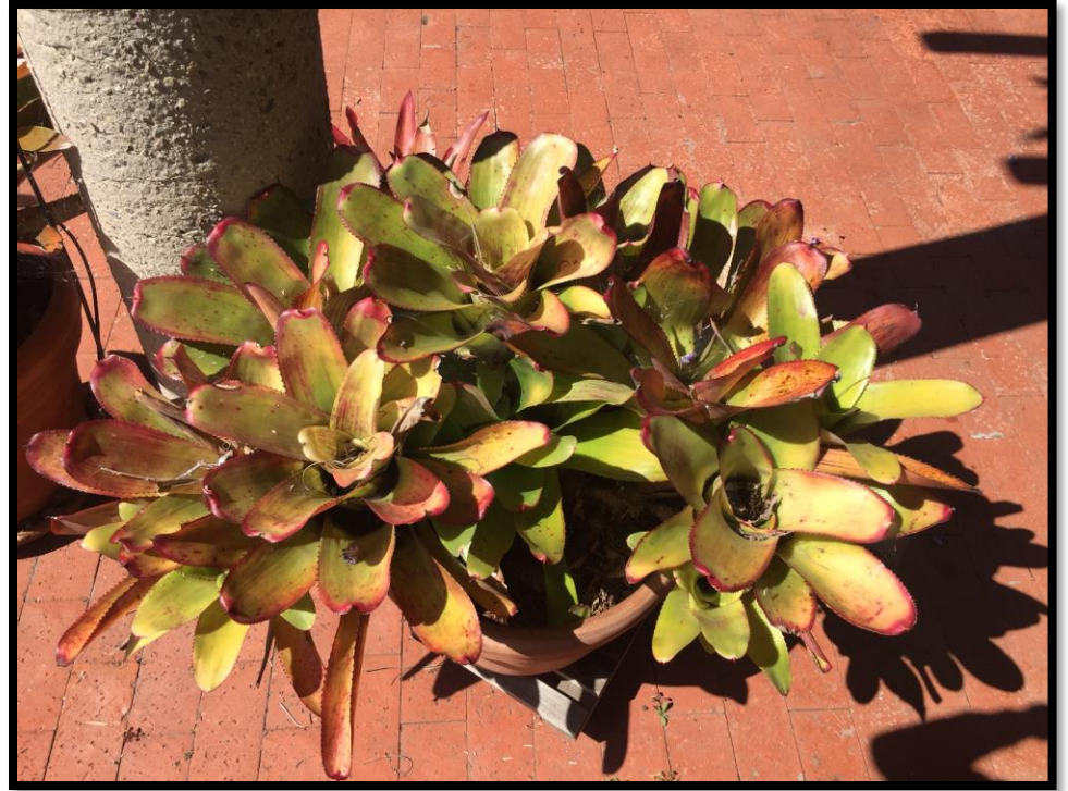
Neo green apple - sunny

a bed under the eaves in my south facing back yard and filled it with lava rock. So they are shaded but get lots of light and my theory is that the lava rock holds moisture that the plants can draw upon when they like and it keeps humidity high without rotting the roots. My several V. hieroglyphicas, V. flammea, V. Red Chestnut, V. Redondo Beach, V. gigantea, VL Swampfire (Arden cross of V. inflata X T. multicaulis) all grow and bloom great in this bed with watering only once a week in summer and every other or less other seasons. I also planted Guzmania wittmackii and several other guzzies in this area; Guzmania grow wonderfully if you do not overwater them.