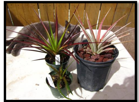
Some of April's offerings

Our speaker Tom Biggart will have for sale orchids, bromeliads including nice tillandsias, plus handmade pottery.