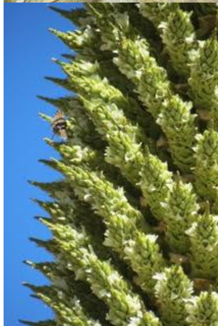
Nancy and P. raimondii , detail of info with bird

Tell me again the story about that neo you brought back from the Australian conference and later found that they had used bobby pins to curl the leaves for the show.